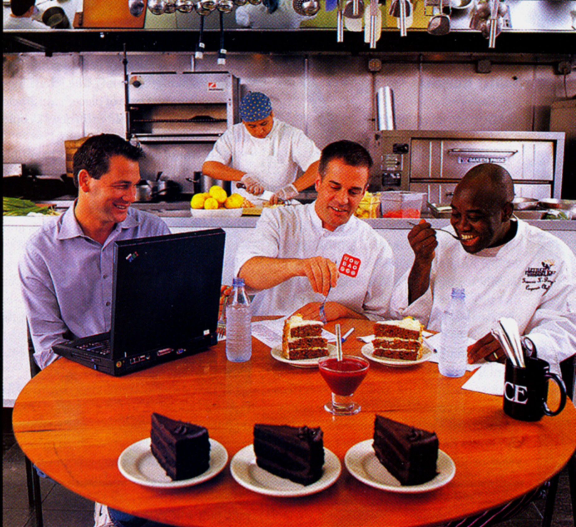
» Taste buds: Lettuce lets them eat cake in the company test kitchen.

want to play k or take a an Allstate Northbrook e Tri-State, ore. Allstate, in the Unit- e its workers nice-to-do," e president. ers are better employees." ercise class- te offers em- 401(k) with s, a time-off e their days ernity leaves, ce. Employ- annually for ey can earn